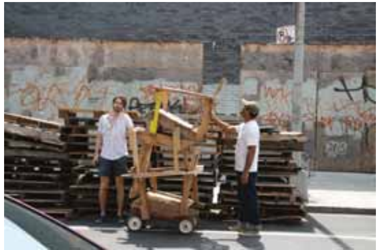
Step 1: Collect used shipping pallets.

Whether to rest, socialize, or to simply watch the world go by, increasing the supply of seating almost always makes a street, and by extension, a neighborhood, more livable.