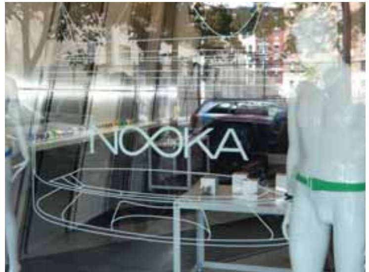
A Pop-Up Shop