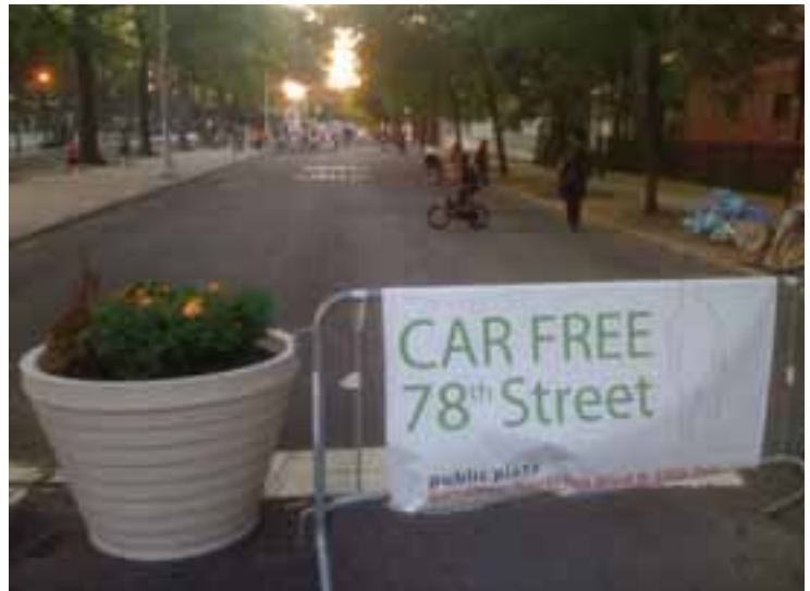
Car free space provides carefree play space.