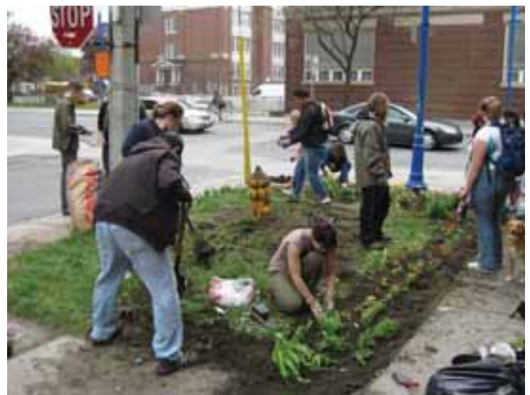
Green Guerillas at work. Credit: Guerilla Gardening Development Blog