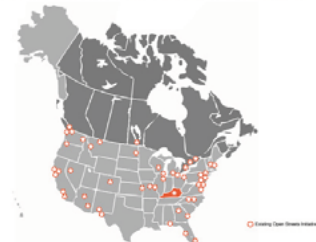
North America’s Open Streets Initiatives.