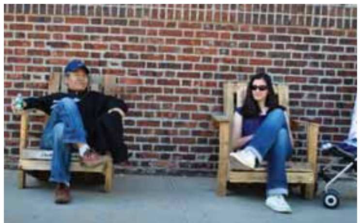
Step 3: Place chairs where needed. Credit: Aurash Khawarzad