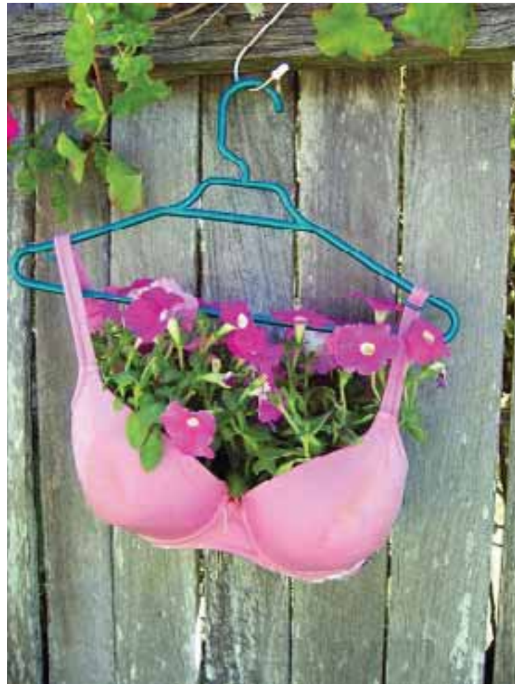
Guerilla Gardening offers an outlet for creative energy.

Guerilla gardening is an excellent tactic for instantly improve an urban neighborhood. Often times, gardens are cared for years after they were first created illegally. Indeed, the first garden started in vacant New York City lot by the Green Guerilla's became so loved that it is now maintained by volunteers and the New York City Parks Department. This is how tactical urbanism is intended to work.