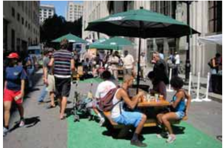
Street fairs help bring communities together in the public realm.