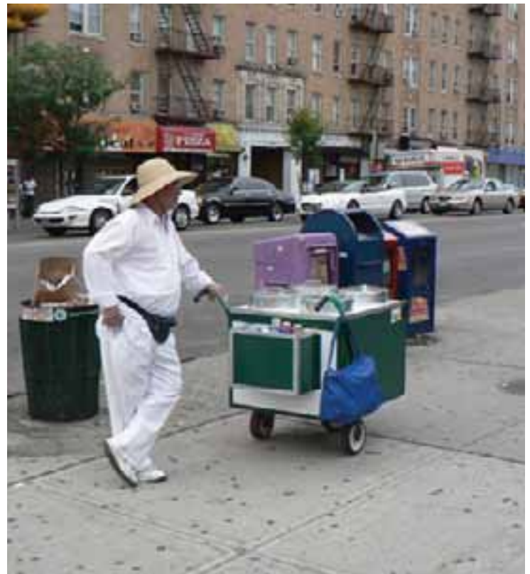
A New York City Street Vendor

According to Shinohara, vendors play a key role in animating the various spaces of a city. This “Custom Bike Urbanism [...]” suggests a possibility of constructing urban spaces that are individualist and dispersed, yet able to accommodate a multitude of dynamic forms. With the inherent characteristics of mobility and ephemerality, it brings vibrancy to redundant urban space and enhances the function of the existing city.”