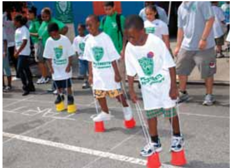
Play streets give kids space to move.

In New York City, a 'play street' is made possible when 51% of the residents living on a one-way residential block sign a petition and offer it to their local police and transportation officials, who then send it to the local community board for review. Once the community board approves the idea, the initiative can take shape and the city provides youth workers to supervise the program. Approximately 75% of these initiatives are organized by the New York City Police Athletic League.