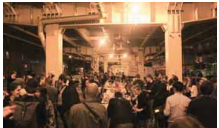
A group of non-profit and neighborhood organizations hosted a 2011 PARK(ing) Day after party below the Brooklyn-Queens Expressway.