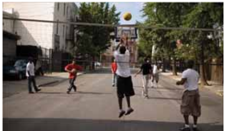
Play streets provide playgrounds where they don't currently exist.