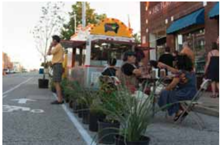
Fort Worth, TX Build a Better Block.

in Fort Worth, TX, Oyster Bay, NY, and Memphis, TN where 15,000 participants helped reinvigorate a stretch of Broad Avenue.