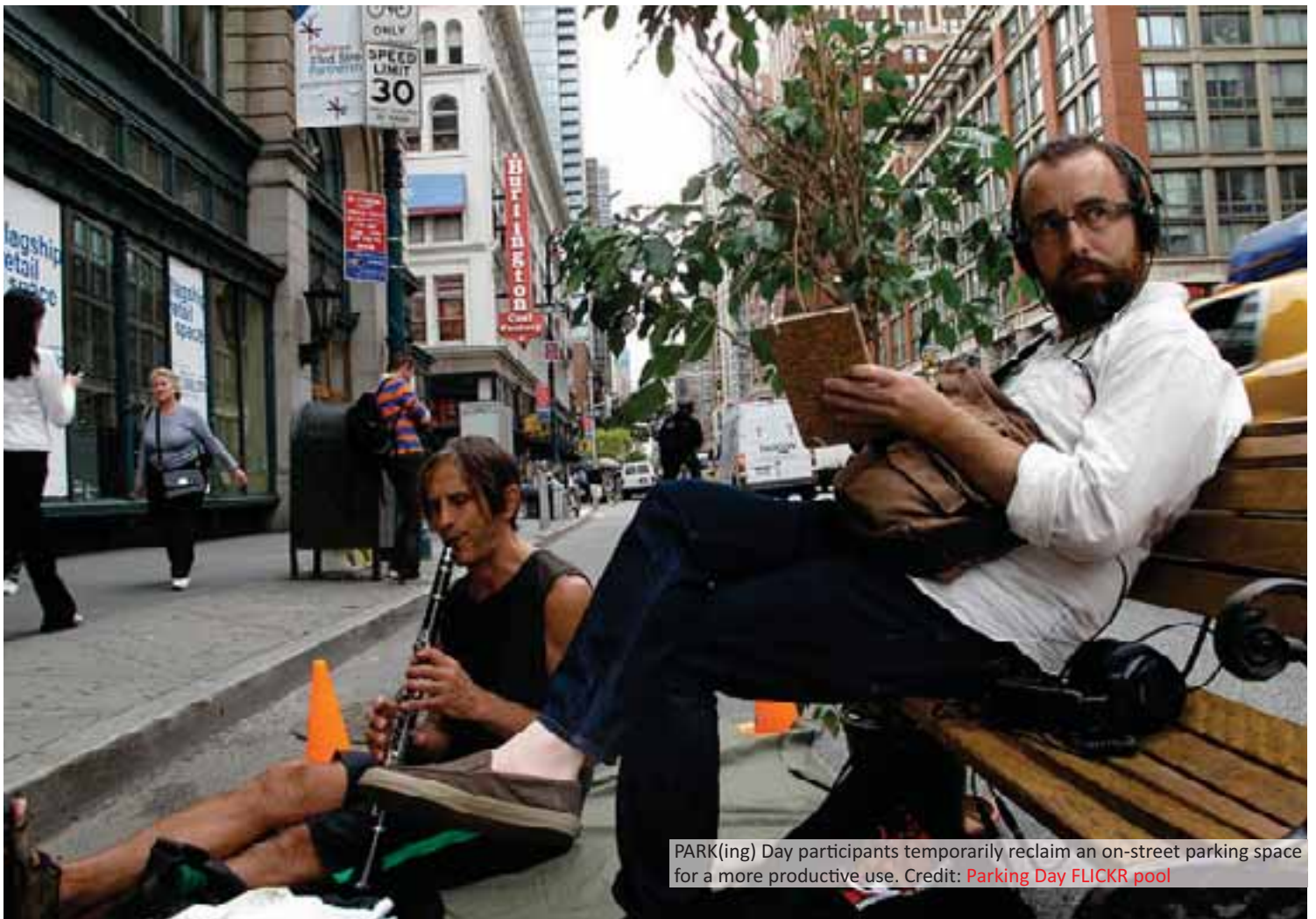
PARK(ing) Day participants temporarily reclaim an on-street parking space for a more productive use.