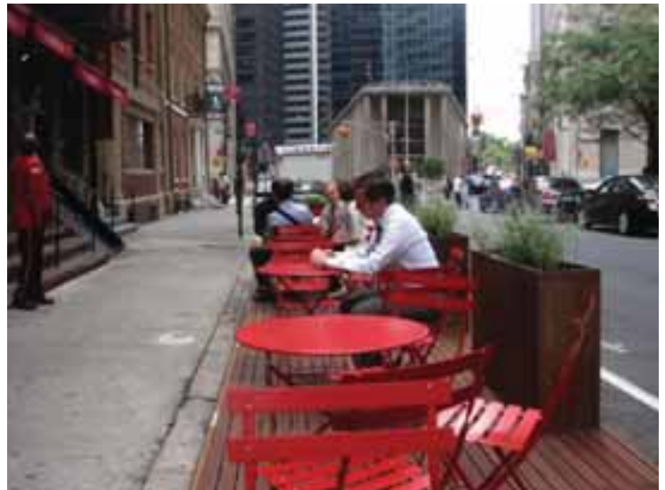
Trading parking space for outdoor seating that can be used by restaurant patrons or passersby is a win-win.