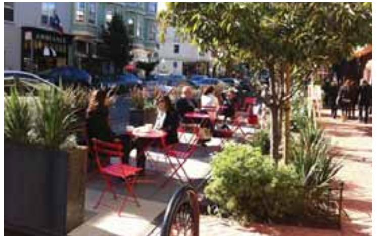
San Francisco's Pavement to Parks.