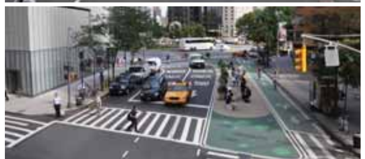
NYC's Greenlight for Broadway provides more space for people.