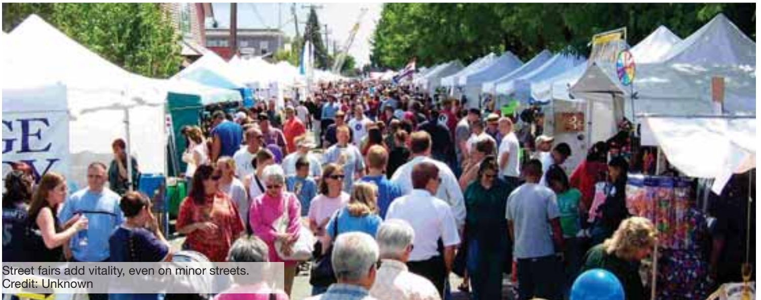
Street fairs add vitality, even on minor streets.