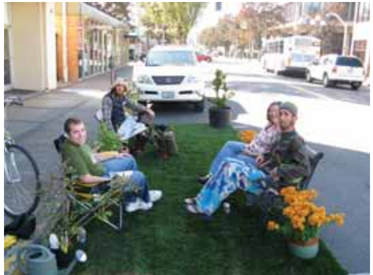
A simple PARK(ing) Day installation.