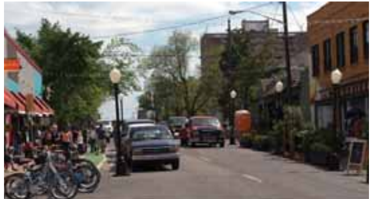
Before and after: Dallas Build a Better Block