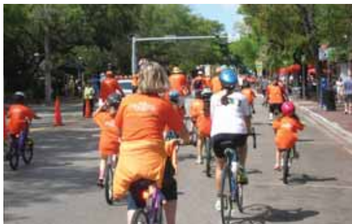
Bike Miami Days