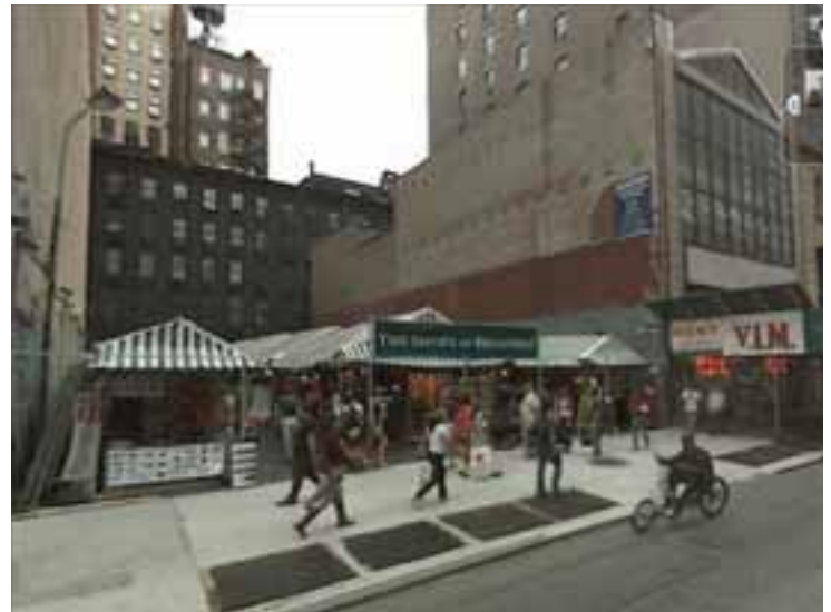
Pop-up tent-based retail helps activate this vacant lot.

More than just marketing ploys for large retail corporations, pop-up stores genuinely bring vitality and help businesses transition to permanent spaces.