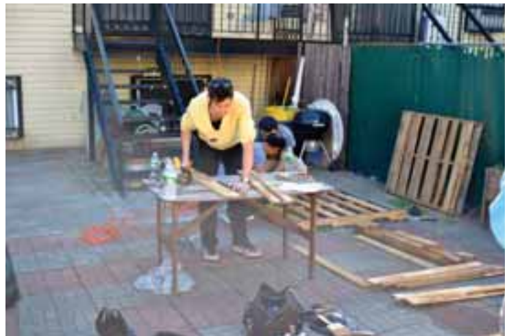
Step 2: Make chairs.