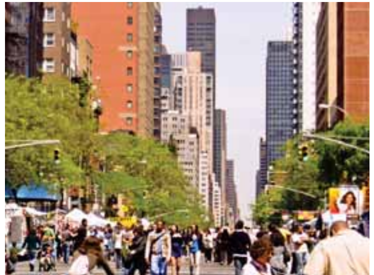
One of New York City's many street fairs.

OVERVIEW: Street Fairs are a traditional aspect of community life in many American cities. Typically organized as annual events, these initiatives bring together a wide variety of organizations and institutions from the local community and give them the opportunity to showcase their products and services. It is the type of event where people become familiar with each others skills and learn what their community has to offer. Often, street fairs take place within a community's main street, or at larger sites, such as the village green or a centrally located plaza. This can raise the visibility of the city's premier public space and offer entertainment to citizens of all ages: many well-programmed street fairs feature musical performances, art exhibitions, interactive entertainment, and local food vendors. Street fairs can also provide the opportunity for communities to organize political support for local improvement initiatives.