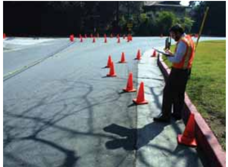
Temporary experiments can test physical improvements prior to implementation.

If included as part of a public charrette process, some examples of tactical urbanism may more quickly build trust amongst disparate interest groups and community leaders. Indeed, if the public is able to physically participate in the improvement of the city, no matter how small the effort, there is an increased likelihood of gaining public support for larger scale change later. Additionally, involving the public in the physical testing of ideas can yield unique insights into the expectations of future users and the types of design features for which they yearn; truly participatory planning should go beyond drawing on flip charts and maps