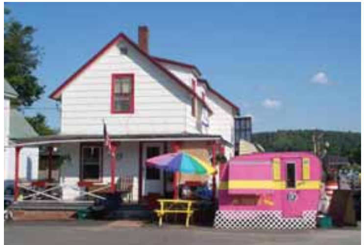
Food carts offer low start-up costs for any entrepreneur.