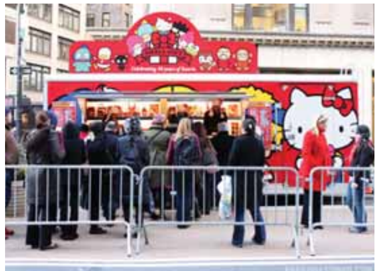
A Pop-Up Shop, Credit: Freshnessmag.com