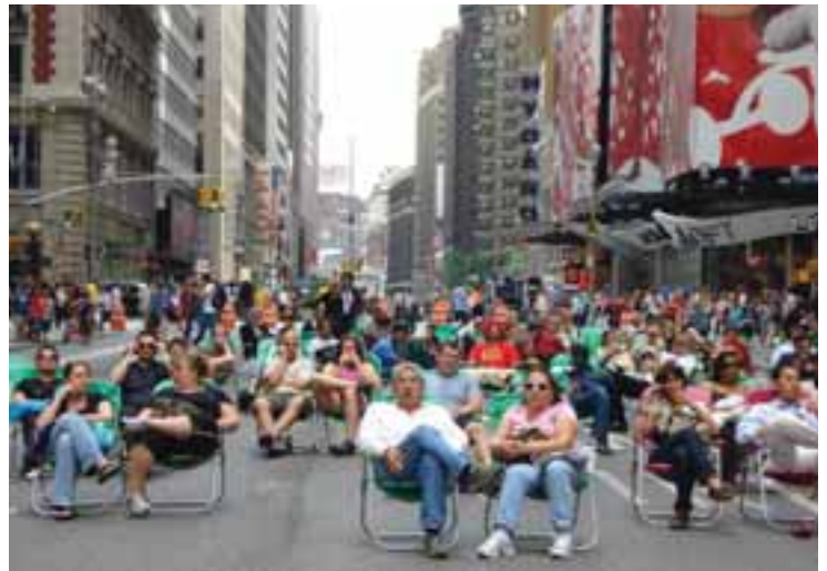
Phase 1 of the new Times Square simply added lawnchairs.

By taking the experimental, "lighter, faster, cheaper," approach, the City and public-at-large are able to test the performance of each new plaza without using up scarce public resources. If successful, the intervention can then transition into a more permanent design and construction phase, as is happening currently in several of New York City's new plazas and sustainable street "pilot" projects.