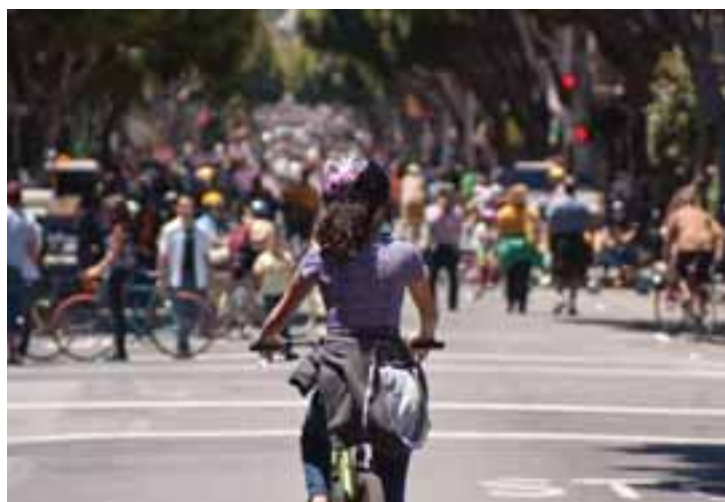
San Francisco’s Sunday Streets