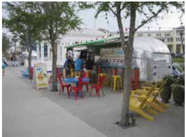
Food carts line Seaside, FL's central square.