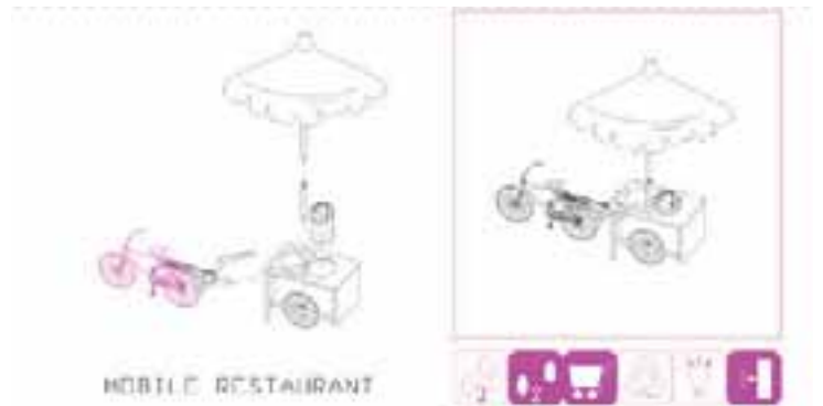
Above and below: Mobile vending continues to increase in popularity.