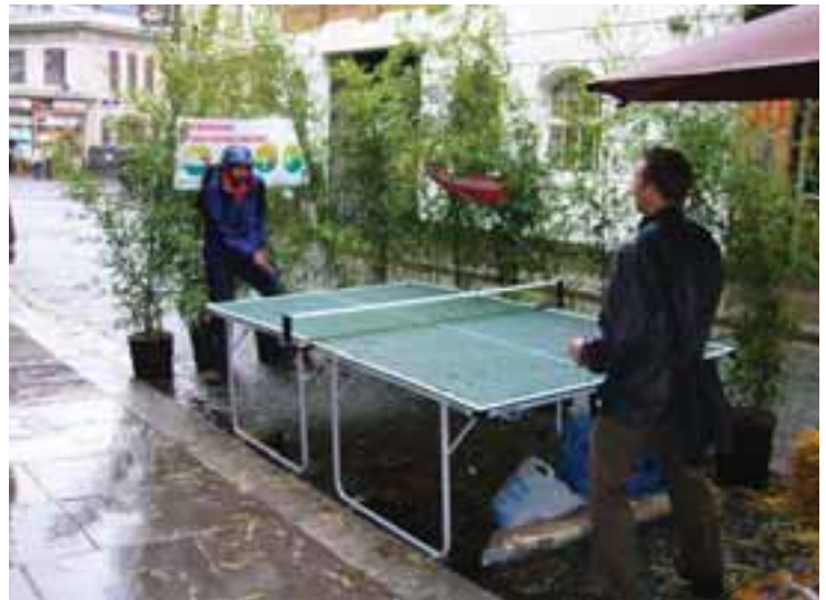
Rain or shine, PARK(ing) Day brings creativity to city streets.

While participating individuals and organizations operate independently, they do follow a set of established guidelines. Newcomers can pick up the PARK(ing) Day Manifesto , which covers the basic principles and includes a how-to implementation guide.