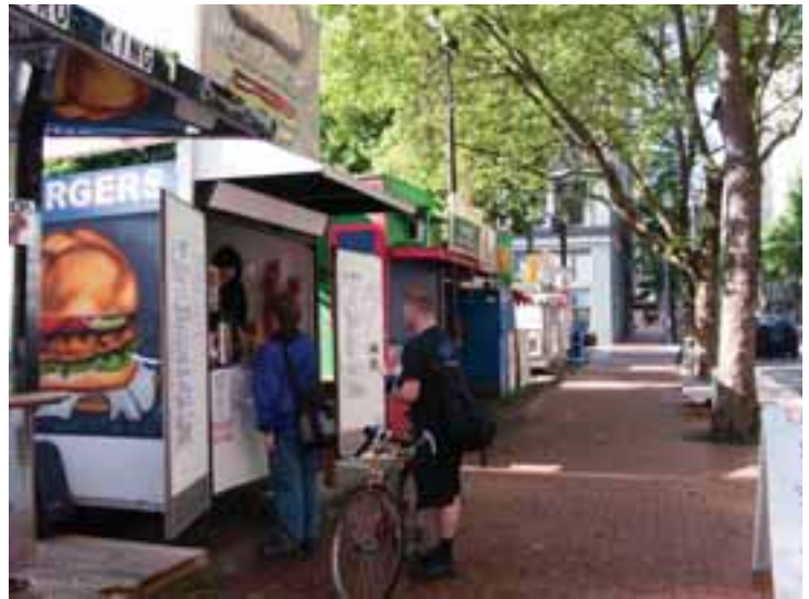
Food carts in Portland, OR

From Los Angeles to Miami, smart cities not only lower the barriers to entry, but also nurture such businesses because they contribute to the city's local economy and add a great sense of place.