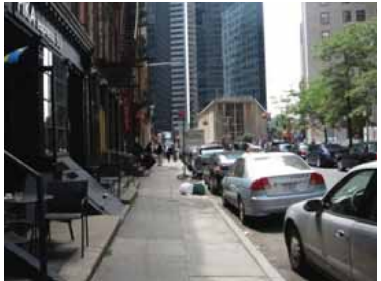
A narrow sidewalk limits the possibility of outdoor seating.

In city's with a short supply of space and a need for more publicly accessible seating, pop-up café's are fast becoming a valued addition to the public realm. If successful, they can also prove the need for permanently expanding city sidewalks.