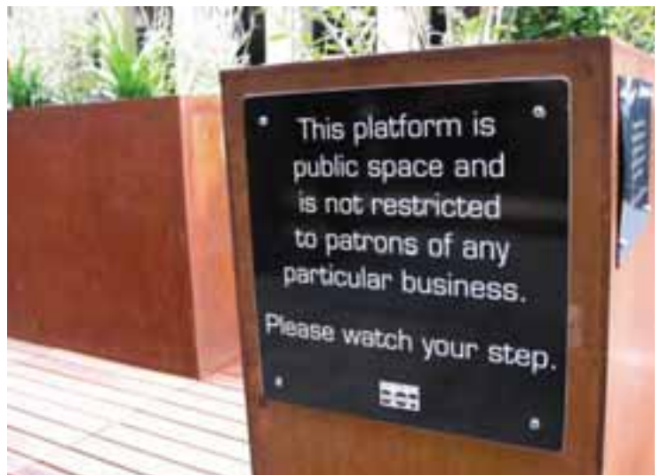
New York City now sanctions what used to be done by advocates.