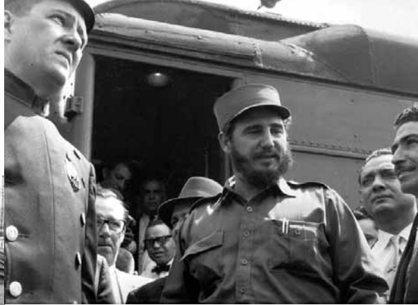
1959 Fidel Castro comes to New Haven